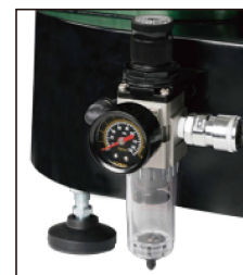
pressure regulating valve (included)